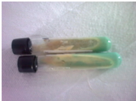
Figure 2. Positive mycobacterial culture