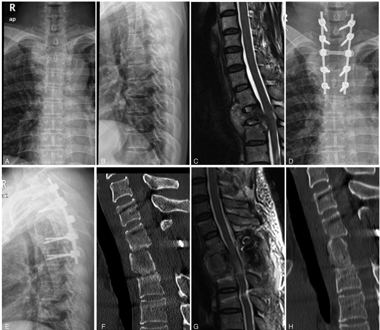
FIGURE 2. Preoperative anteroposterior and lateral X-ray of a 39-year-old female with tuberculosis of T2, who presented with a local kyphosis angle of 20° (A, B). Sagittal T2 WI (C) images showed active tuberculosis with abscess formation, vertebral destruction, and cord compression. This patient was treated by the posterolateral approach with pedicular screw-rod fixation. Postoperative X-rays (D, E) of the same patient showed good decompression and kyphosis correction, with a kyphosis angle of 9°. Postoperative sagittal thoracic CT imaging showed good positioning of the grafting iliac bone (F). Postoperative sagittal T2 WI (G) images showed no significant residual lesions around T2 and complete spinal cord decompression. At the 8-month follow-up examination, a sagittal thoracic CT revealed solid bony fusion, no loss of kyphosis correction, and no obvious recurring lesions around T2 (H).