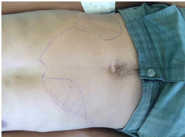
Figure 3 Clinical manifestation of visceral leishmaniasis in HIV-infected patient, showing hepatomegaly and splenomegaly.

azar dermal leishmaniasis-like lesions), two had oral lesions, two had lymph node involvement (one with intra-abdominal lymph node involvement), and one patient had rectal lesions. 40