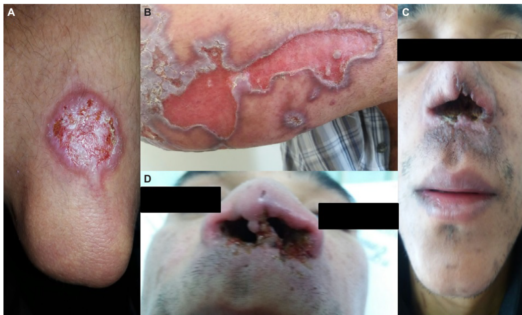
Figure 2 Lesions of tegumentary leishmaniasis.