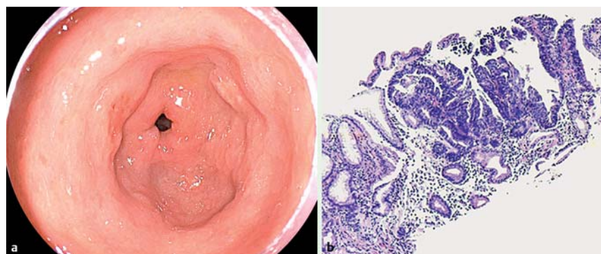
Fig. 2 a Ila+Ilc lesion 7 mm in diameter located on the antrum anterior wall. b Histopathology revealed high-grade dysplasia with typical distortion of the foveolar architecture, cell proliferation, and increased nucleus/cytoplasm relationship.

As for premalignant conditions, atrophy was found in 3 (0.5%), atrophy and metaplasia in 6 (1%), and intestinal metaplasia without atrophy in 171 (30%) of the patients. The overall prevalence of at least 1 premalignant condition was 31%. There was no association between clinicopathologic factors and patients diagnosed as having no premalignant, premalignant, and neoplastic lesions. Frequency of premalignant conditions, was higher in patients older than age 60 ( P < .02 ). Hp positivity was found in 206/384 (53.6%), 114/173 (66%), and 6/16 (37.5%) of patients diagnosed as having no premalignant, premalignant, and neoplastic lesions, respectively. Overall, the Hp-positive rate was 57%. Intravenous sedation with midazolam was administered to 469 (82%) of patients. No differences were found in the detection of intraepithelial neoplasia in patients receiving or not receiving sedation.