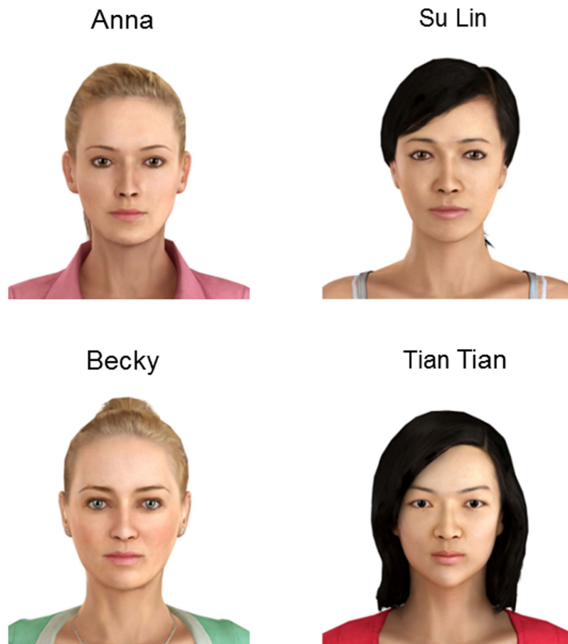
Figure 2. Avatar appearances. This image was created using Vizard virtual reality software (WorldViz Inc, Version 5.4, http://www.worldviz.com/virtual-reality-software-downloads/ ).

Debriefing. The participant provided written and verbal answers to a series of questions to determine whether they had noticed the mimicry manipulation or guessed the purpose of the experiment.