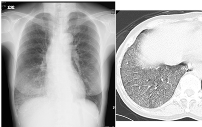
Fig. 2. After chest tube drainage, interstitial shadow in lower field of the right lung showed no change. Ground-glass attenuation was seen on chest CT.

trigger, and surgical lung biopsy by video-assisted thoracoscopy was performed to diagnose the condition. Histologically, intra-alveolar fibrosis was observed in a small area (Fig. 3a) and abundant cholesterol cleft granulomas (Fig. 3b), fibrin deposition (Fig. 3c), and aggregating lymphocytes along the alveolar walls were observed. These findings were consistent with the findings of exogenous lipoid pneumonia. Subsequently, improvement in the chest radiograph findings without additional therapy was observed again, and the patient remained in remission.