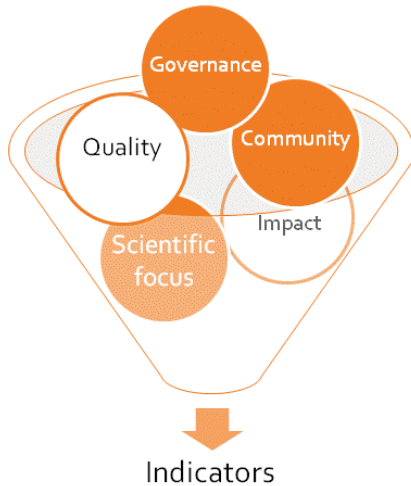
Figure 2. A carefully chosen basket of qualitative and quantitative indicators for bioinformatics resources.

Taking into account that ‘Not everything that can be counted counts, and not everything that counts can be counted’ (William Bruce Cameron 5 ), the indicators will be used to inform a peer-review process described below.