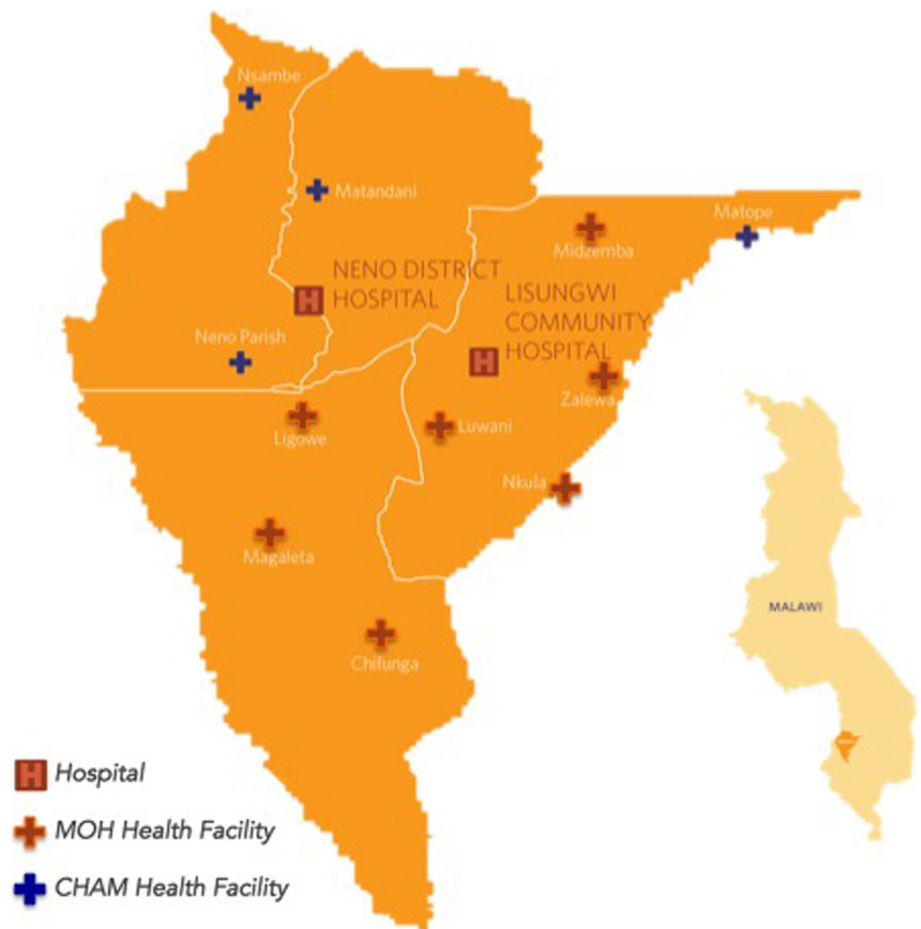
Fig. 2 Map of Neno District, Malawi and location of healthcare centres