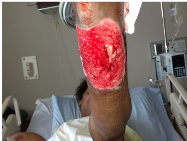
Figure 2 Patient's vascular lesions in the forearm after being cured by enterostomal care.

width = 19%), and platelets of 183 \times 10^3/uL . Her differential showed 75% neutrophils, 20% lymphocytes, 2% monocytes, and bands of 2% with an absolute neutrophil count of 3,465 cells/mm 3 . Urinalysis came with proteinuria (150 mg/dL), occult blood (250 uL), red blood cells (loaded – not countable/high power field), and many amorphous crystals. The punch biopsy of her ear showed superficial thrombosis of superficial vascular plexus with perivascular lymphocytic infiltrates and deeper sections showed epidermal necrosis and necrotizing vasculitis (Figure 3). Cultures of the ulcers came back with no organism growth. Also, blood cultures and urine culture were negative for an infective organism. This patient was started on a high dose of steroids, but didn't finish treatment since she escaped from the hospital.