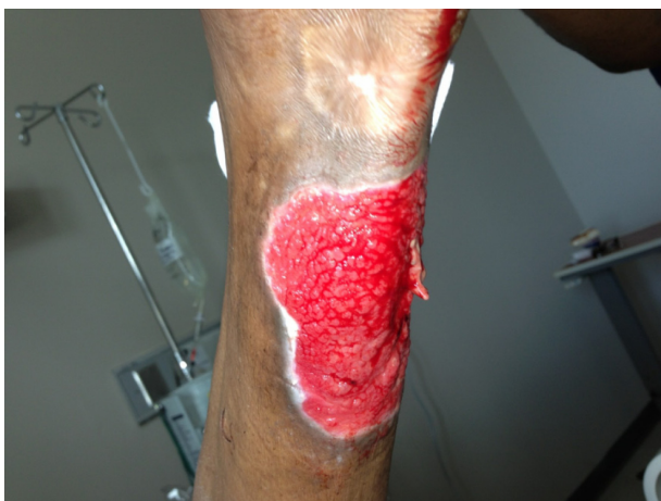
Figure 1 Patient's knee lesions after being curated by the enterostomal team.