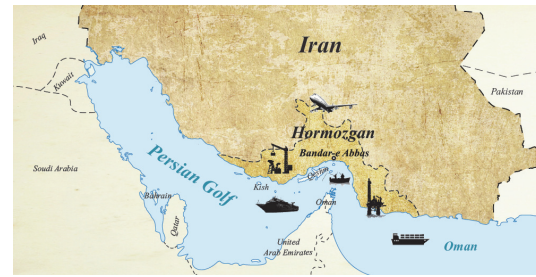
FIGURE 1: Location of Hormozgan province and Bandar Abbas city in the north coast of the Persian Gulf demonstrating the highly active port for trading, fishing, oil industry and tourism.

2.2. Drug Susceptibility Testing. Proportion method was used for determination of susceptibility of isolates to isoniazid (0.2 µg/mL), rifampin (40 µg/mL), ethambutol (2 µg/mL), and streptomycin (4 µg/mL) [22].