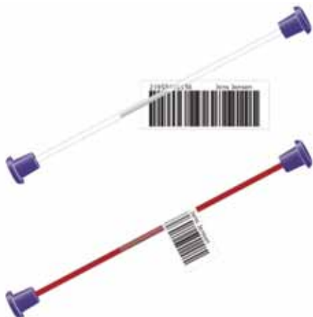
FIGURE 2. Recommended capillary blood gas sample labelling

Laboratory personnel are responsible for appropriate written instructions for sample collection according to the ISO 15189 standard (27). Arterial blood collection is performed by physicians (18) and nursing graduates (19) in healthcare institutions in Croatia. In order to ensure arterial sample quality and result reliability, laboratory personnel should inform ward personnel responsible for arterial blood collection of the required procedures.