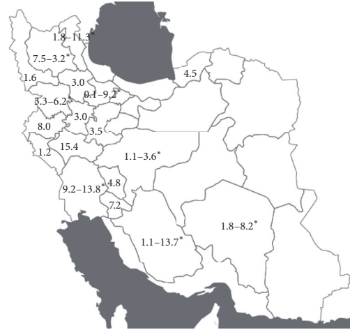
FIGURE 2: Graphic representation of prevalence (%) of HCE in provinces in Iran. The asterisk (*) means the minimum and maximum of prevalence in province.

to heterogeneity rather than chance, with a range from 0 to 100 percent (values of 25%, 50%, and 75% are considered to represent low, medium, and high heterogeneity, resp.). Subgroup meta-analysis analysis was used to compare the prevalence of hydatidosis among age, sex, and lab methods groups. Egger’s test was used to evaluate the publication bias [14, 15]. Statistical analyses were conducted using the Statistical Software Package (STATA) version 11.1.