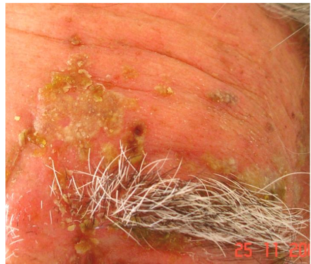
Figure 6. Herpes zoster ophthalmicus with secondary bacterial superinfection (impetiginization). Honey-colored crusts on erythematous base at the sites of zoster skin lesions and conjunctivitis. Plentiful Staphylococcus aureus was grown from the lesions.

incidence of all complications increases with age (40). Ocular involvement was described above. Secondary bacterial superinfection by Staphylococcus aureus or Streptococcus pyogenes (Figure 6) is the most frequent cutaneous complication of HZV and may affect the development of subsequent post-herpetic neuralgia (PHN). PHN is defined as pain lasting after the rash has disappeared, usually when pain is present for 90 days after the onset of rash (13). Except for PHN, neurologic complications of HZO are rather rare and may include acute or chronic encephalitis, myelitis, aseptic meningitis, autonomic dysfunction, motor neuropathies, and cranial nerve palsies (41).