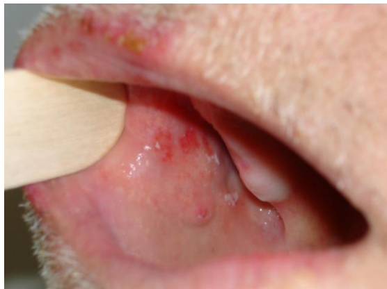
Figure 2. Oral Herpes Zoster Lesions

The skin of the lower eyelid is affected and slight conjunctivitis is evident. The lesional skin is covered with a fusidic acid containing crème.