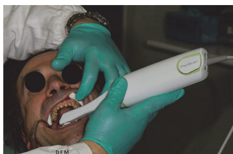
FIGURE 4: Intraoral digital scan of the preparations of both dental arches.

Temporary PMMA restorations were cemented with eugenol-free cement (Temp Bond NE, Kerr GmbH, Rastatt, Germany, or Freegenol, GC, Bad Homburg, Germany).