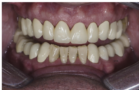
FIGURE 3: Clinical evaluation of the aesthetic and functional outcome of the provisional.