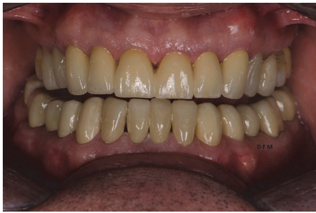
FIGURE 7: Clinical intraoral result after cementation.

Schaan, Liechtenstein), colored with IPS e.max CAD Crystall Shades (Ivoclar-Vivadent, Schaan, Liechtenstein), and crystallized in ceramic furnaces following the manufacturer's instructions.