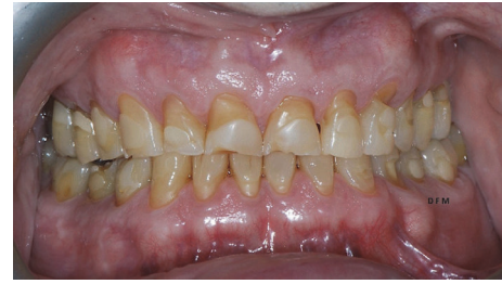
FIGURE 1: Intraoral preoperative conditions. Notice widespread cervical abrasions and abfractions.

2.2. Intraoral Scan. All the impressions required for the implementation of the arranged treatment plans were taken using a Planmeca PlanScan intraoral scanner (Planmeca OY, Helsinki, Finland). This is a device that relies on short wavelength laser light projection (450 nm). The scanner does not require the application of powder on the intraoral surface and it has several interchangeable autoclavable tips, in various sizes, to suit the clinical situation. It can be used simply by connecting it to a computer or prepared dental unit, allowing it to be operated easily in various workstations. In addition, the scanning software allows digital casts to be exported in the open STL format, giving the clinician complete freedom in the management of the subsequent stages of the prosthetic rehabilitation using Exocad software (Exocad GmbH, Germany, 2010).