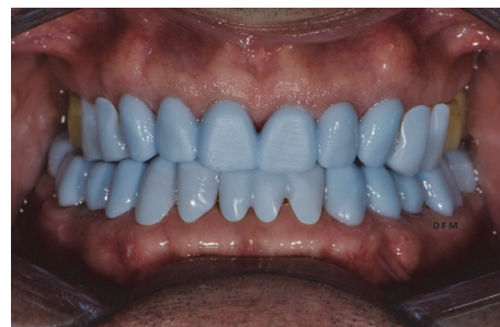
FIGURE 5: Clinical test and evaluation of the definitive crowns design through the 3D printed crowns: analysis of the finishing lines, interproximal areas, occlusal contacts, and aesthetic result.