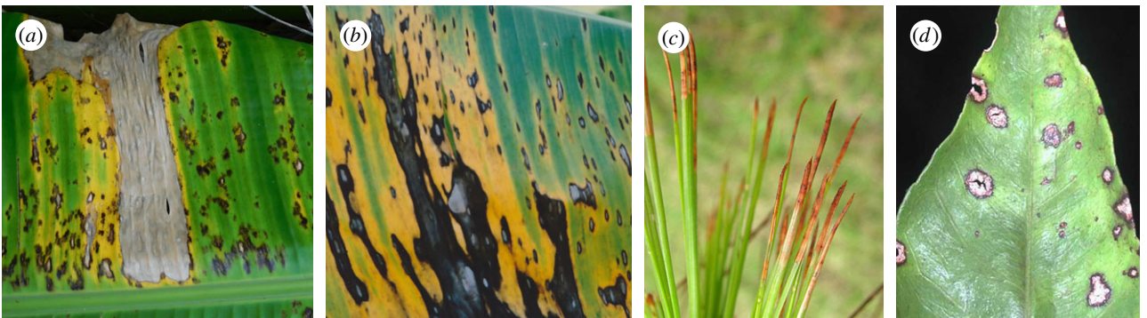
Figure 3. Foliar diseases caused by (a,b) Pseudocercospora eumusae and P. fijiensis on Musa , (c) Dothistroma septosporum on Pinus and (d) Pseudocercospora angolensis on Citrus . The Mycosphaerellaceae comprises one of the largest families in the Phylum Ascomycota , in which some species have evolved as latent pathogens, saprophytes or symbionts. For example, D. septosporum , the causative agent of Red Band Needle Blight disease, is an important pathogen of Pinus spp. [27], which has also been isolated from asymptomatic pine needles. Species of Pseudocercospora are commonly associated with leaf spots, with some taxa such as P. angolensis on Citrus [53], and P. fijiensis , P. musicola and P. eumusae on Musa [26] being of major quarantine concern. Other than these examples, a great number of species from diverse genera in the Mycosphaerellaceae are commonly isolated as latent pathogens, occurring on a wide range of asymptomatic host plants [25].

described plant pathogens. A potential remedy would be for the International Commission for the Taxonomy of Fungi to implement a set of guidelines that authors, editors and reviewers could follow to ensure that, wherever possible, relevant genotypic data are provided to supplement novel species descriptions of suspected or known plant pathogens. The current absence of such guidelines hampers both progress and the application of broadly accepted best practices in fungal identification and description. This is not only to the detriment of mycology, but also of global food and fibre production and ecosystem health.