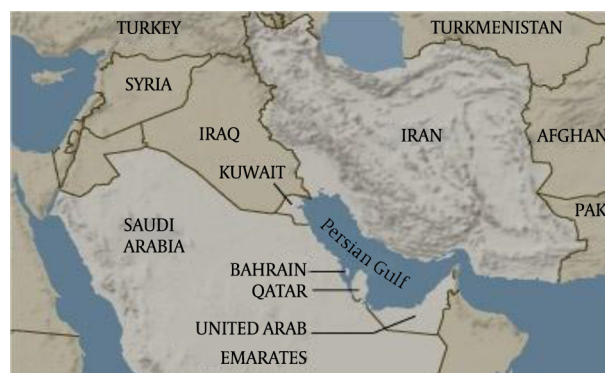
Figure 1. Arab States in Southwest Asia

According to the recent world population reviews, the states have minorities of Arab or Arabic-speaking nationals. However, there are a number of expatriate workers in the states (Figure 2). Expatriates in the states are mainly temporary workers from India, Pakistan, Southeast Asia,