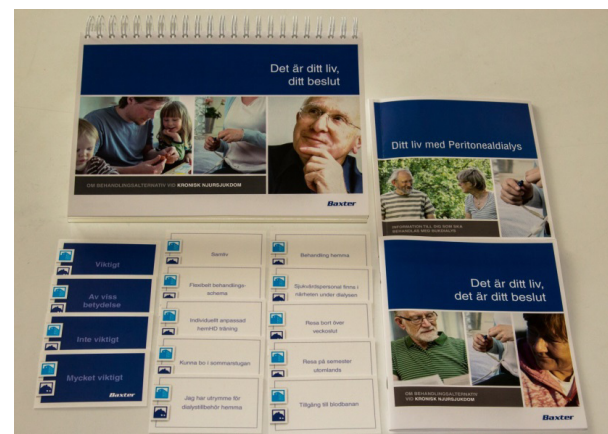
Figure 1 UPS-EP tools (Swedish version).

Abbreviations: UPS, unplanned dialysis start; EP, educational program.