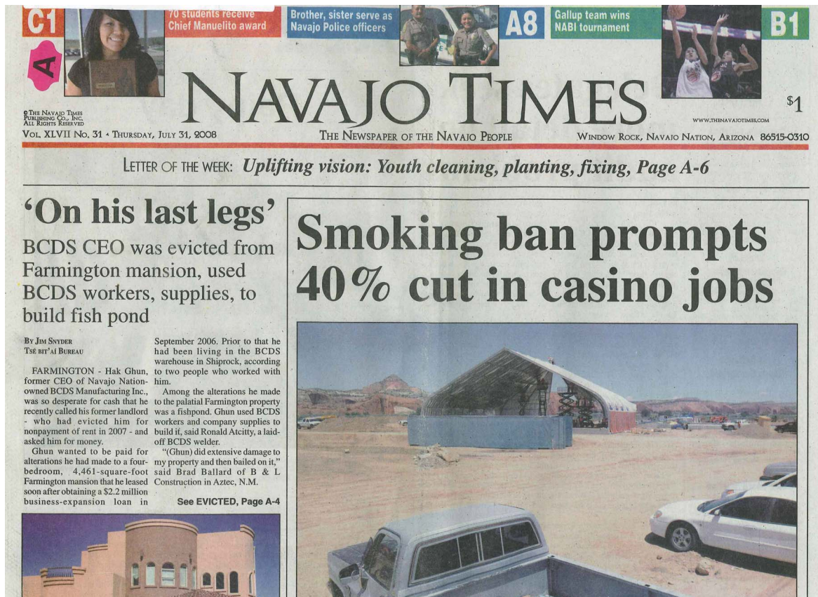
Figure 1 Navajo times headline.

evidence of a tobacco-specific carcinogen in the urine of casino workers. 30 With this evidence, Team Navajo launched extensive educational outreach to Navajo leaders and communities consisting of radio forums, radio and newspaper advertising and participation in events such as fairs, church-affiliated rallies and ceremonial gatherings.