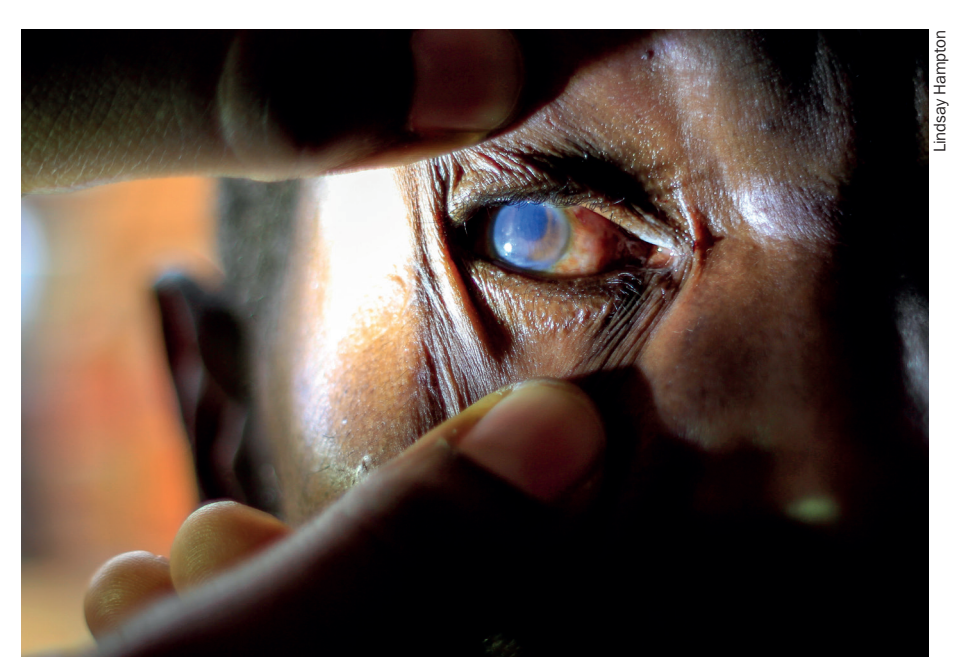
This patient has a hazy cornea and a peaked pupil following cataract surgery. There was also vitreous loss during surgery. KENYA

Complications are rare and in most cases can be treated effectively. In a small proportion of cases, further surgery may be needed. Very rarely, some complications can result in blindness.