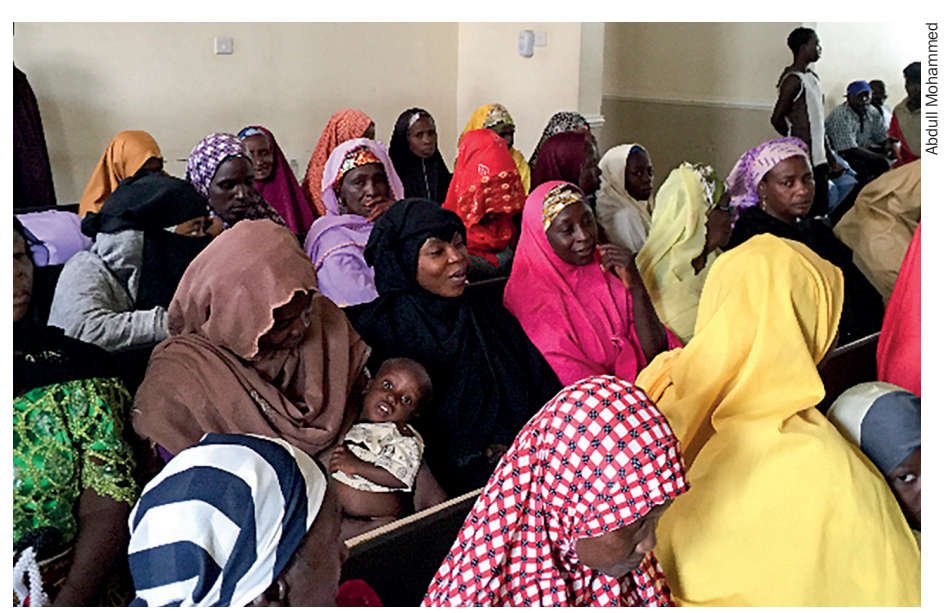
Patients wait for their follow-up examination, which will include IOP measurement – an essential component of postoperative glaucoma care. NIGERIA