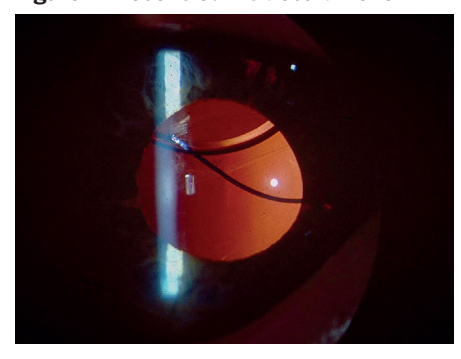
Figure 1. Decentred intraocular lens

have fallen back into the eye. In either case, blurred vision or pain may be experienced and further surgery may be necessary.