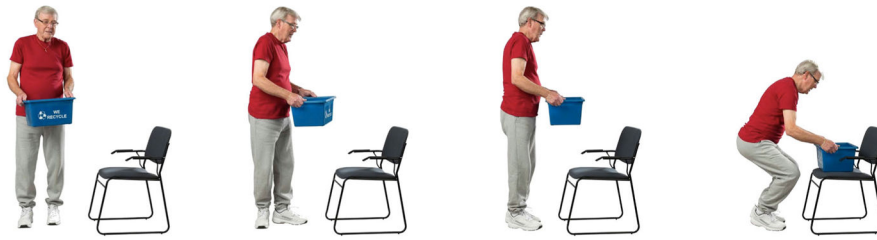
Note step-to-turn above

Hold the item in front of and close to your body.