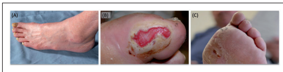
Figure 3. Clinical features of advanced uraemic neuropathy: (a) atrophy of musculature in the distal lower limb, (b) ulceration and (c) amputation.

Diagnosis and management. The gold standard for diagnosis of neuropathy is clinical neurological examination including nerve conduction studies, which examine conduction velocity and amplitude. Nerve conduction studies in patients with uraemic neuropathy typically demonstrate changes of an axonal neuropathy, with reduced sensory amplitudes initially and reduced