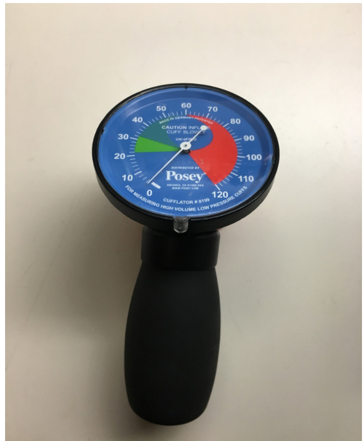
Figure 1. Posey Cufflator™ endotracheal tube inflator and manometer.

Data were collected by critical care paramedics and nurses and entered at the time of measurement into a data collection form created for the purpose of the study. These data were then transcribed to a computer database for analysis.