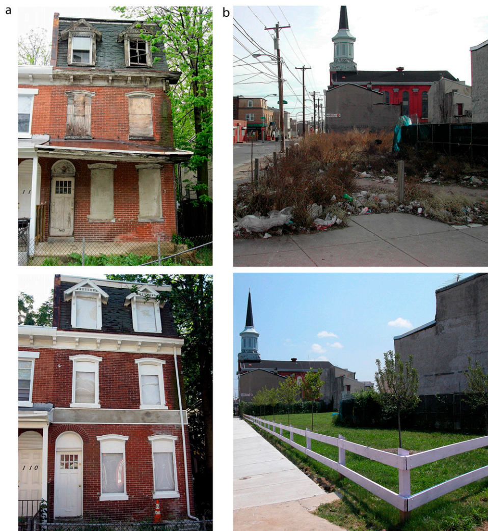
FIGURE 1—Before–After Examples of Remediation Treatments of (a) an Abandoned Building and (b) a Vacant Lot: Philadelphia, PA, 1999–2013

outcomes and sociodemographic factors in the areas surrounding each building or lot by using ArcGIS. For the abandoned buildings, we calculated these metrics monthly, and for the vacant lots, we calculated these yearly. We used the longitude–latitude locations of all assault outcomes to calculate a kernel density estimate and interpolate the assaults per square mile at the centroid of each building or lot. We assigned the value of each sociodemographic factor to the longitude–latitude location of the centroid of its block group and then we used an inverse–distance weighting calculation to interpolate the value of the sociodemographic factor at the centroid of each building or lot. In this way, crime and sociodemographic measures