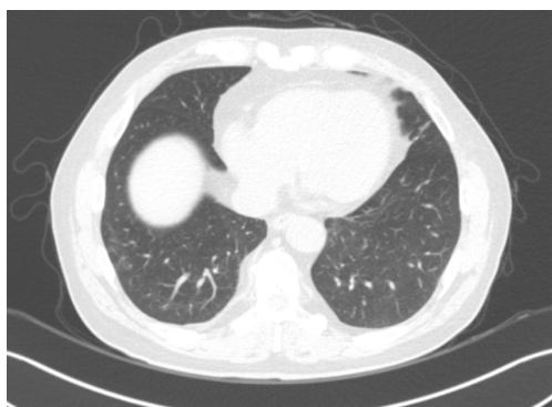
Figure 3 Complete resolution of consolidation and ground-glass opacities after the corticosteroid treatment.