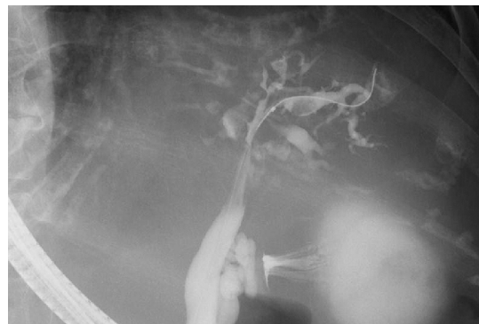
Figure 3. Endoscopic retrograde cholangiography (ERC) demonstrated cystic dilated biliary ducts with stones.