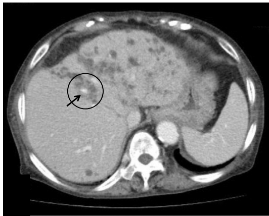
Figure 2. Contrast-enhanced abdominal CT showed the central dot sign (circle), representing the fibrovascular bundle (arrow) within the dilated cystic intrahepatic ducts, which is considered to be a characteristic feature of Caroli's disease.

Hepatic phenotype variants have been previously reported in ADPKD patients. Dransart et al. observed intrahepatic bile duct abnormalities in 25 of 90 ADPKD patients (27.8%) with magnetic resonance cholangiography, which were correlated with hepatobiliary infection (16). Ishikawa et al. reported that common bile duct dilatation occurred more frequently in ADPKD patients than in non-ADPKD patients (17). Terada et al. examined specimens from autopsied livers and biliary tracts of three patients with ADPKD using intrahepatic cholangiography and found nonobstructive dilatation of the intrahepatic bile ducts in all cases (18). Jordan et al. reported the 17-year history of an ADPKD patient with a recurrent fever of unknown origin that was later attributed to Caroli's disease with multiple episodes of cholangitis (4). These phenotypic variants might be due to dif-