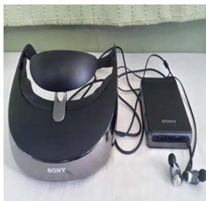
Fig. 1 SONY head mounted display: HMZ-T3W-H eye trek system.

This was an endoscopist blinded randomized control trial. The study was carried out in the Professorial Endoscopy Unit, Colombo North Teaching Hospital, Ragama, Sri Lanka, from May 2014 to May 2015. Consecutive patients with an indication to undergo elective day-case colonoscopy for medical indications were enrolled in the study in the absence of exclusion criteria. The exclusion criteria included visual or hearing impairment, allergies or hypersensitivity to premedication, patients who had had abdominal surgery or colectomy, personal history of anxiety or psychiatric disorder, and pregnancy. Written informed consent was obtained from all subjects before their participation in the study. Using computer generated numbers, patients were randomly assigned to three groups: the AD group was allowed to listen to the music of their choice during colonoscopy, the VD group was allowed to watch a film of their choice with sound using a SONY head mounted display (HMZ-T3W-H eye trek system; Fig. 1 ), and the control group (C) only received standard sedation during the colonoscopy. For VD, patients were supplied with a list of movies from which they chose any one they preferred. In order to match the variety of interests, we provided Sinhala, Hindi and English action, comedy and cartoon films. For AD, a list of songs of the patient's choice was obtained from a list of songs in Sinhala,