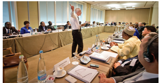
Photo: Ministers of Health participating in a Roundtable Meeting hosted by the Harvard Ministerial Leadership Program.

In Turkey, after a regime change in 2002, the government implemented a Health Transformation Program (HTP) with significant commitment from political leadership. This transformation led to increased levels of public satisfaction with the government [7] and influenced voter intentions in favor of the government [29].