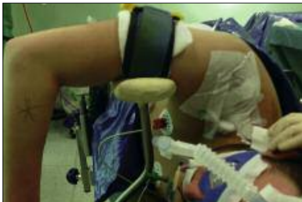
Fig. 2. Patient positioning: modified lateral decubitus position with the operative arm positioned in 100° flexion/90° internal rotation at the level of the shoulder and held in place by an arm holder. The elbow is positioned in 90° of flexion, with the forearm hanging free under gravity.