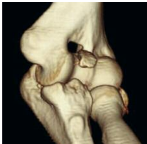
Fig. 1. 3D CT scan of a right elbow. The image shows a fracture of the coronoid process of the ulna.

The right side was affected in 2 patients and the left side in 2 patients. On clinical examination, all the patients complained of elbow instability and severe pain at the posterior and medial aspects of the elbow.