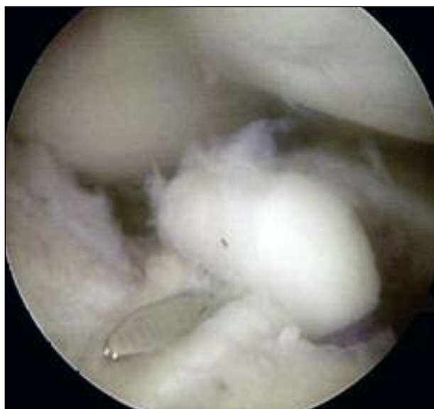
Fig. 4. Arthroscopic view through an anterolateral portal obtained using a 30° scope. Right elbow. The Kirschner wire emerges from the anterior aspect of the unfractured coronoid process.

prevent it from advancing too far anteriorly. Once the Kirschner wire emerges from the anterior aspect of the unfractured coronoid process, a cannulated drill (4 mm diameter) is advanced over the Kirschner wire ( Fig. 4 ). Once all the sutures have been retrieved posteriorly, an arthroscopic button (Endobutton, Smith&Nephew, London, UK) or is used to complete the knot tying ( Fig. 5 ).