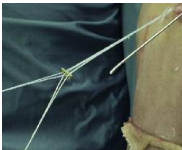
Fig. 5. External view. Once all the sutures have been retrieved posteriorly an Endobutton is used to complete the knot tying.