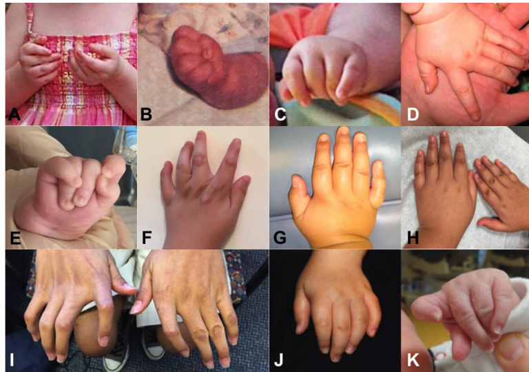
Figure 2. Hand phenotypes in patients with Schaaf-Yang syndrome

Affected patients manifest a spectrum of phenotypes, including contractures of the interphalangeal joints, camptodactyly, tapering of the fingers, brachydactyly, clinodactyly, and adducted thumbs. A, patient 2; B, patient 3; C, patient 4; D, patient 7; E, patient 9; F, patient 10; G, patient 11; H, patient 13; I, patient 14; J, patient 15; K, patient 17.