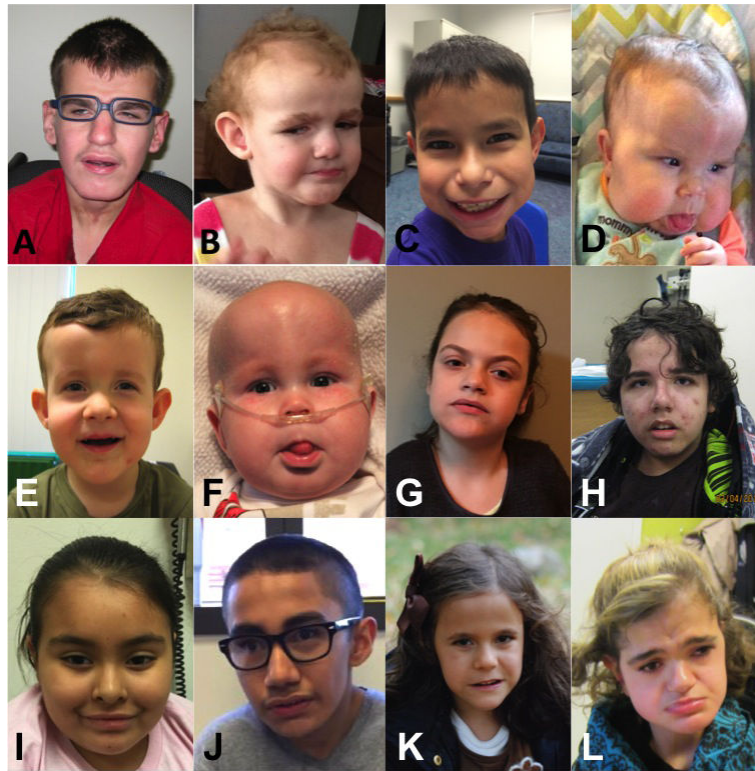
Figure 3. Facial phenotype of individuals with Schaaf-Yang syndrome

While several individuals manifest dysmorphic facial features, such as short noses, bushy eyebrows, and prognathism, the consistency of facial characteristics across individuals is limited. A, patient 1; B, patient 2; C, patient 3; D, patient 4; E, patient 7; F, patient 9; G, patient 10; H, patient 11; I, patient 13; J, patient 14; K, patient 15; L, patient 18.