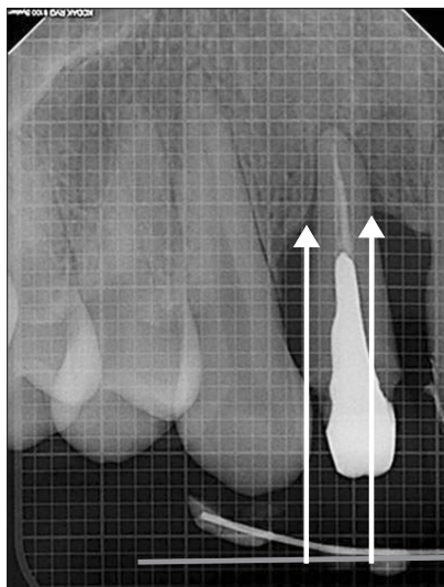
Figure 1. Schematic radiographic illustration demonstrating the measurement of interproximal alveolar bone height. Horizontal bar represents the tangential line drawn from the wire in the acrylic stent and used as a reference point.

The data were analyzed using the SPSS statistical software program (version 20 for Windows; IBM Co., Armonk, NY, USA). The mean and standard deviation of the PD and CAL for each tooth at baseline were compared with the post-treatment values. Significance was evaluated by non-parametric Wilcoxon signed-rank test. Normality tests for the parameters of the