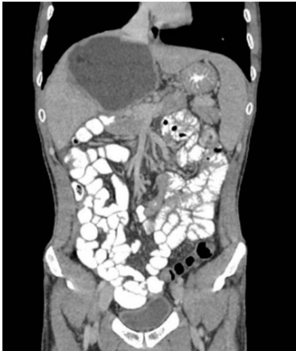
Figure 1. Hydatid cyst at the hepatic hilum, the cavernous transformation of the portal vein and patent superior mesenteric vein.

postoperative adjuvant albendazole (800mg per day). Two weeks after the surgery, a percutaneous drainage had been performed due to ongoing postoperative abdominal pain. After percutaneous drainage, a biliary fistula appeared and was treated with endoscopic retrograde cholangiography. At the admission to our center, his laboratory tests were in normal ranges. Abdominal imaging methods (ultrasound, computed tomography and magnetic resonance imaging) revealed splenomegaly, portal vein thrombosis, and cavernous transformation at hepatic hilum and the previously treated hydatid cyst (Figure 1).