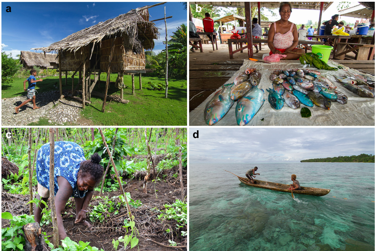
Fig. 2 Panel figure depicting discussed elements of life and livelihoods in rural Solomon Islands, showing (clockwise); a a house in Malaita Province (photo by Filip Milovac), b a woman selling reef fish at the provincial capital market in Western Province (photo by Filip Milovac), c gardening in a small-scale agricultural plot (photo credit Jan van der Ploeg), d two men fishing with a net over reef from a dug-out canoe in Malaita Province a dug-out canoe used for subsistence and small-scale fishing (photo by Filip Milovac)

husband's plans in order to improve their household well-being. Most respondents reported that if women had their own money, her husband would have final say on how it was spent. In contrast, in community 1, women were reportedly leading improvements for their households due to their involvement in the communal savings club, and these women were often significant contributors to household income. Women reported that, “men want to ask for help [to improve their household's well-being], but they are ashamed. They are worried that others may talk about them negatively” , and that these attitudes hindered men's ability to drive improvements for their household.