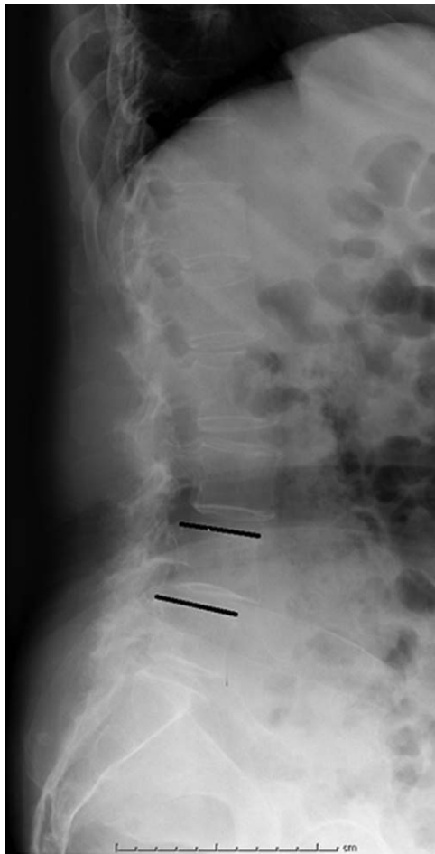
Figure 1. The measurement of Taillard index: the forward displacement distance of upper vertebral body/the length of the upper vertebral body \times 100%.

The lateral X-ray images for individual patients were retrieved from our Picture Archiving and Communication Systems (PACS). The Taillard index was defined as the relative displacement distance between the involved vertebrae divided by the horizontal length of the upper vertebral body (Fig. 1). The LL was the angle