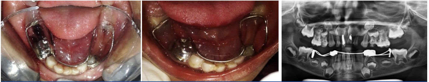
[Table/Fig-4]: Post-operative (indirect vision) photograph after cementation of the appliance. [Table/Fig-5]: Photograph (indirect vision) of the modified distal shoe appliance after eruption of permanent first molar (10 months after placement). [Table/Fig-6]: OPG for assessment of appliance after eruption of permanent molar.

coupled with a non-restorable (following caries removal) 84 was best treated with extraction and suitable space maintenance. Similar treatment strategies have also been adopted in the literature wherein restoration of function has been given its due importance [4,5].