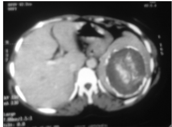
Figure 1: CECT abdomen of the patient showing cystic lesion in spleen with a calcified wall that on operation proved to be hydatid cyst

The treatment for all the patients was surgical. All the patients received preoperative and postoperative albendazole chemotherapy. Out of 527 patients of hydatid disease studied over a period of 15 years, 38 (7.2%) patients had hydatid cyst present at atypical location, with their ages ranging from 17 years to 69 years (mean 36.2 years). Spleen was the most common