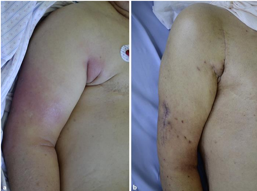
Fig. 2. Visual findings of the right upper arm. a On day 2 of administration, erythema developed and swelling increased. b After 2 weeks of surgical drainage, erythema disappeared and swelling diminished.