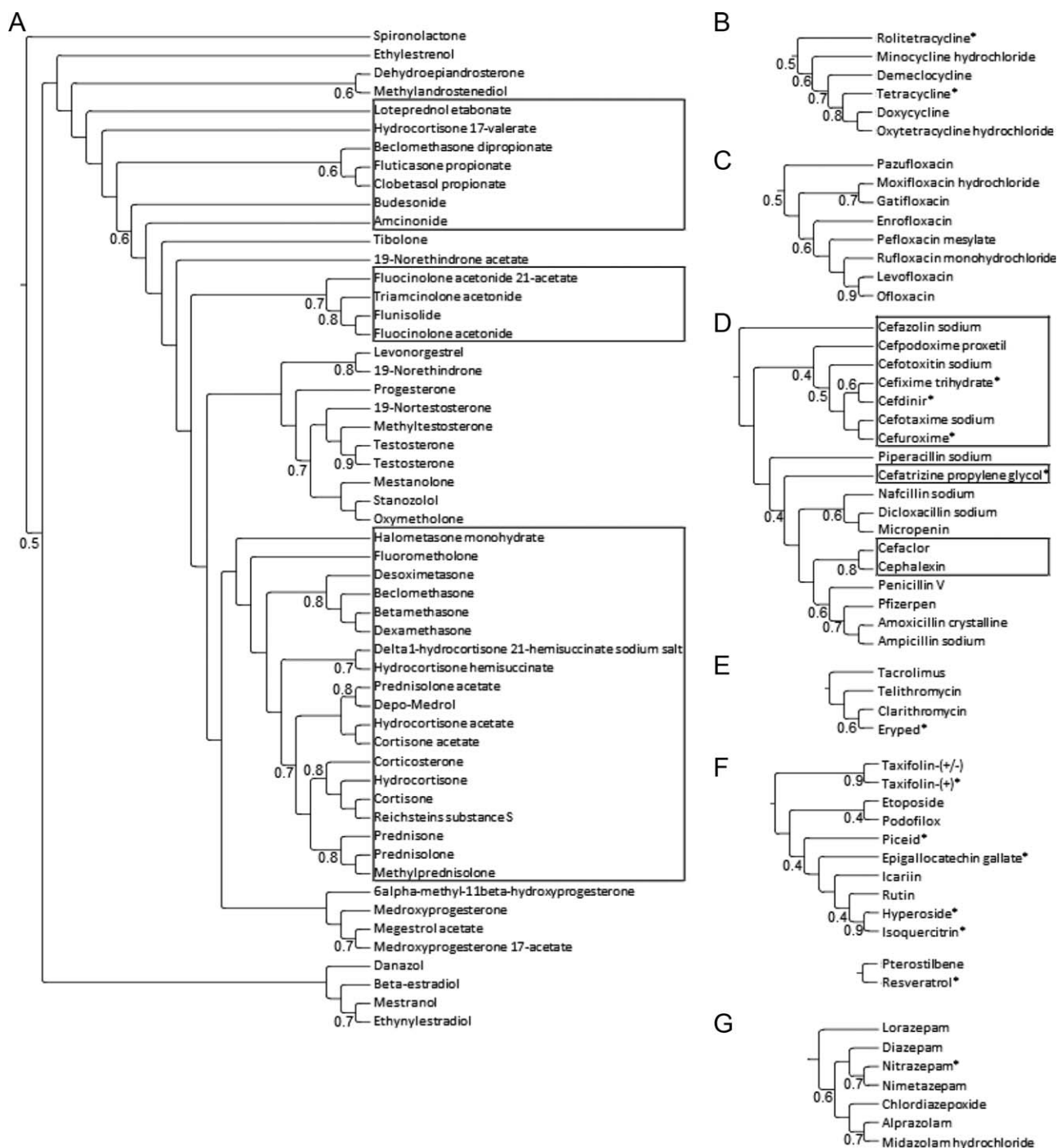
FIGURE 2 Dendrograms illustrate hierarchical clustering of hormones (A), tetracyclines (B), fluoroquinolones (C), \beta -lactams (D), macrolides (E), flavonoids and stilbenoids (F), and benzodiazepine GABAA receptor modulators (G), from the NCC, annotated with Tanimoto coefficients to indicate degree of similarity between compounds in the clusters. Outlined in (A) are glucocorticoids, outlined in (D) are cephalosporins. * indicates compounds which appear in Table 1 or 2.