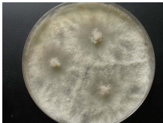
Figure 2. Botryotinia fuckeliana KF666, colony grown for 14 days on WSP30 medium.