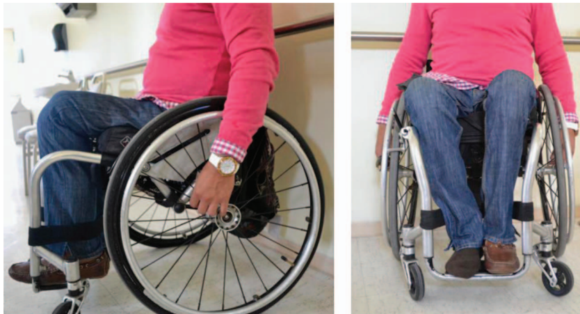
Figure 3. Lateral and front views of the patient with the prosthesis.

viscoelastic foam was then elaborated and pressure maps showed minimal pressure zones.