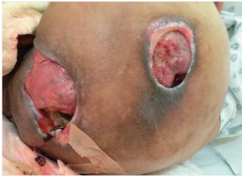
Figure 1. Ischiatic and trochanteric pressure ulcers.

Due to the patient's high esthetic and functional demand in his work activity, once he was stable, a third joint session was held with personnel from the Institute's SCI Rehabilitation, Plastic Surgery, Amputee Rehabilitation and Engineering Services, and it was decided to undertake the elaboration of a cosmetic prosthesis and the manufacture of a viscous elastic foam cushion to prevent the formation of new PU.