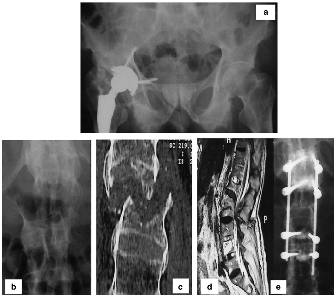
Figure 2. Patient no.3: Male, 73 years old, unstable L2 transvertebral fracture and retroperitoneal hematoma after a trivial trauma. Radiographs of the pelvis—old hip arthroplasty (a), and of the lumbar spine (b, c). T2-weighted sagittal MRI, documents the transvertebral fracture (d). Postoperative radiograph (e) after realignment and posterior fusion (T12-L4 spondylodesis with titanium instrumentation and polymethylmethacrylate vertebroplasty). Neurological status: L2 AIS-C paraplegia (at admission) and L2 AIS-D (at discharge).