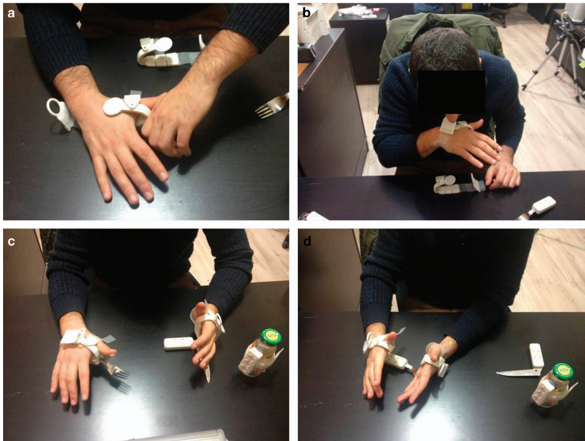
Figure 2. (a) The subject puts his hand into the device; (b) the subject fastens the device pulling the plastic ring with his teeth; (c) the attachment of the 'magnetized' objects; (d) the exertion of a constraint on the objects allows the patient to release the object.