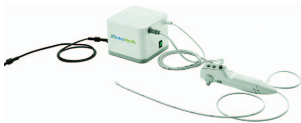
Figure 1. Portable disposable ultrathin endoscopy system.

Korea, Seoul, Republic of Korea from August 2013 to December 2014. Consecutive patients referred for PEG were enrolled and compared with gender and indication-matched historical controls who had undergone PEG under conventional ultrathin endoscope (CUE) guidance. Patients who had a history of esophageal or gastric surgery, were at high risk of gastric bleeding, had mechanical ileus, had a history of PEG insertion, or did not provide written informed consent were excluded. This study was approved by the institutional review board of Seoul St. Mary's Hospital (KC13DISI0255) and registered with ClinicalTrials.gov (NCT02183207).