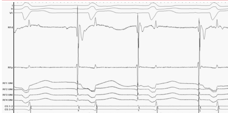
Figure 4: Bipolar/unipolar electrograms from the ablation catheter during sinus rhythm