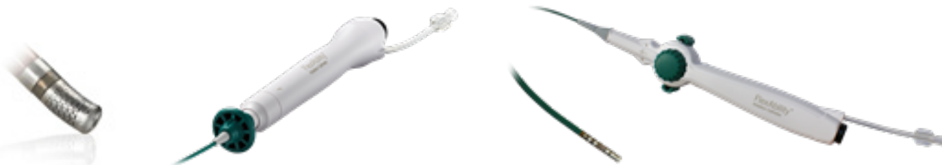
Figure 1: FlexAbility™ catheter tip and handle

St Jude Medical) programmed in power control with a temperature limit of 45°C. Typically Energy was delivered within the first few millimeters of the anterior portion of the left pulmonary veins to achieve catheter stability and effective disconnection (Figure 3). The catheter was then rotated clockwise to extend the lesion posteriorly to the LIPV ostium. Radiofrequency (RF) energy was prolonged when a change occurred in activation/ morphology of the PV potentials. The stability of the catheter was monitored during RF applications using electrograms and intermittent fluoroscopy.