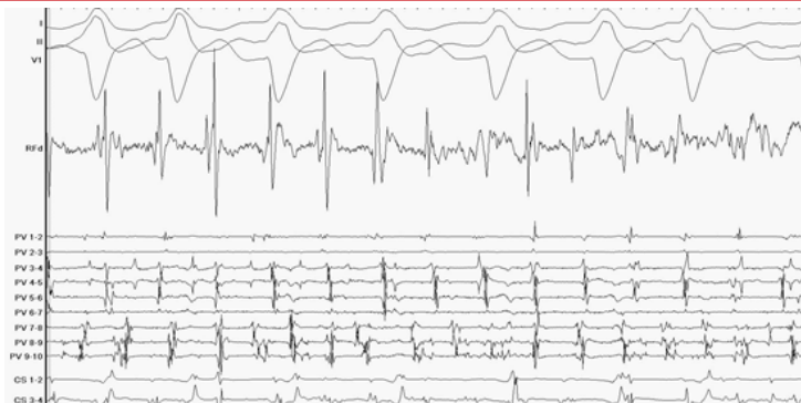
Figure 5: Electrogram assessment at the LSPV during RF energy delivery while in AF

PV's. PVI was achieved by complete elimination or dissociation of all PV potentials as determined by the circular mapping catheter. After PVI, a careful search was performed of the entire circumferential perimeter of each PV, and ablation was performed at sites demonstrating any residual potentials. The final endpoint was