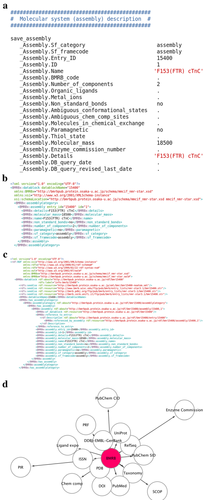
Fig. 1 The sequential data conversion of a BMRB entry from NMR-STAR format. a Part of a BMRB entry in NMR-STAR format. Parts of the entry have been converted to b XML format and c RDF format. d Schematic representation of linked external information resources, where shorter distances from the BMRB represent closer relationships with the BMRB