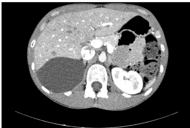
Fig. 2. Abdominal CT scan. A septated cystic tumor of 9.4 cm with apparent no visceral relation.