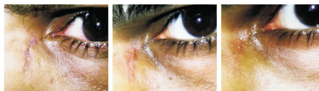
Figure 1 Photographic grading of scar at 2wk (grade 3), 6wk (grade 1) and 12wk (grade 0).

discomfort experienced during suture removal (Table 1) [10] . These being assessed at 2, 6 and 12wk post operatively.