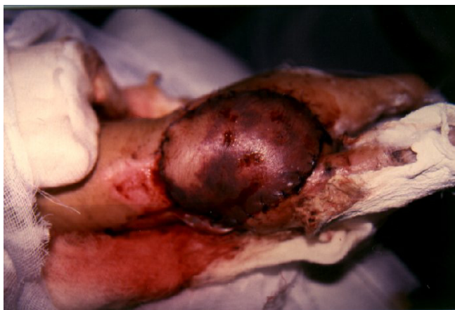
Figure 2 Venous insufficiency of the posterior interosseous flap used for defect reconstruction.