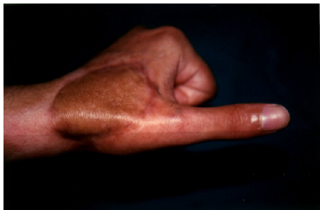
Figure 4 Late follow up of the salvaged flap.