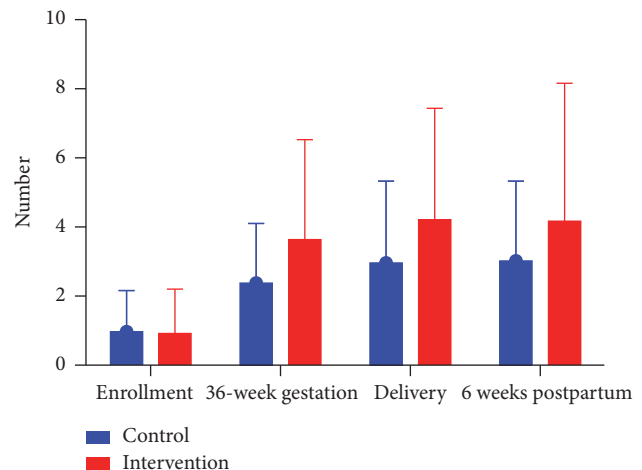
FIGURE 2: Frequency of communication from enrollment until 6 weeks postpartum. Depicting the mean frequency and standard deviation of communication between women and health care workers as reported by women at enrollment, between enrollment and 36 weeks of gestation, between 36 weeks of gestation and within 7 days of delivery, and between the delivery visit and 6–8 weeks postpartum.

3.4. Communication between the Participant and CHWs. At baseline, the mean number of communications both face-to-face and via mobile phone between participants and health workers was similar between groups, 0.92 and 0.96 in the intervention and control sites, respectively (Figure 2). Communication increased in both groups during subsequent visits, with greater cumulative increased communication by delivery in the intervention than control arm, 7.5 (SD: