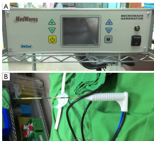
Figure 1 MedWaves microwave ablation system consisting of (A) generator (Avecure MWG881, Medwaves, San Diego, CA, USA); (B) 14G antenna probe (Avecure 14-15-LH-35, Medwaves, San Diego, CA, USA).

needle entrance was performed in all patients to avoid high temperature skin injury or burn.