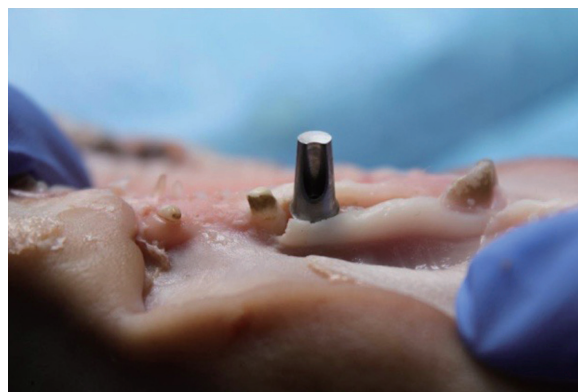
Fig. 4. Placement of the replica implant and positioning of the titanium dioxide abutment (Nobel Biocare, Kloten, Switzerland).

For results concerning the aesthetic aspects of abutments, studies done in the years between 2000 and 2014 and, of these, the ones exclusively based on spectrophotometric analysis were chosen, thus excluding the studies of the ‘Pink Aesthetic Score’ type. 12 These studies were clas-