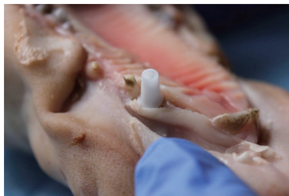
Fig. 6. Positioning the zirconium dioxide abutment, standard BO shade.

sified and compared using the following parameters: ‘study type’, ‘sample size’, ‘variables studied’, ‘results’, ‘gingival thickness’ and ‘position relative to the marginal limit’ (Table 1).