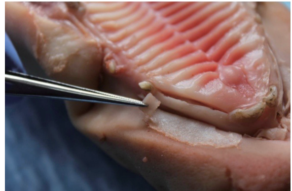
Fig. 1. The site chosen was the anterior part of the superior maxillary area, between the incisors and the canines.

The final thickness of the different sites was measured using an endodontic file (Fig. 3). To minimize artifacts, the different pieces were moistened with saline solution before being superimposed. On each of the sites, 5 implant abutments were tested in a random order: