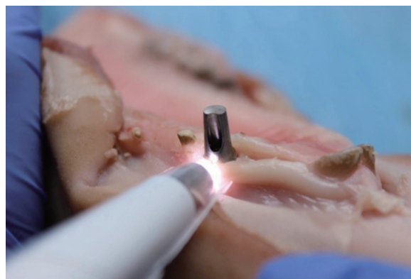
Fig. 5. Recording ICI parameters to determine color variation caused by the abutment, using the VITA Easyshade Advance (Vita Zahnfabrik, Bad Sackingen, Germany).