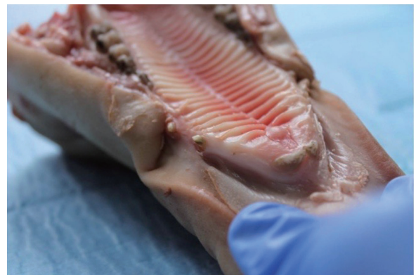
Fig. 2. 1 mm thickness flap, taken at an additional analogous site.